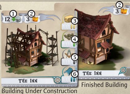
Building Under Construction