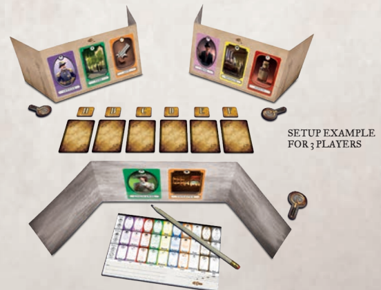
SETUP EXAMPLE FOR 3 PLAYERS