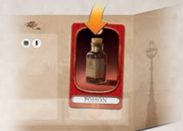
EXTERNAL CARD HOLDER

Note: You will now have received a set of cards from the player to your right, including one Person, one Location, and one Weapon, attached to the outside of your screen so you can't see them. Your goal is to guess the identity of these cards.