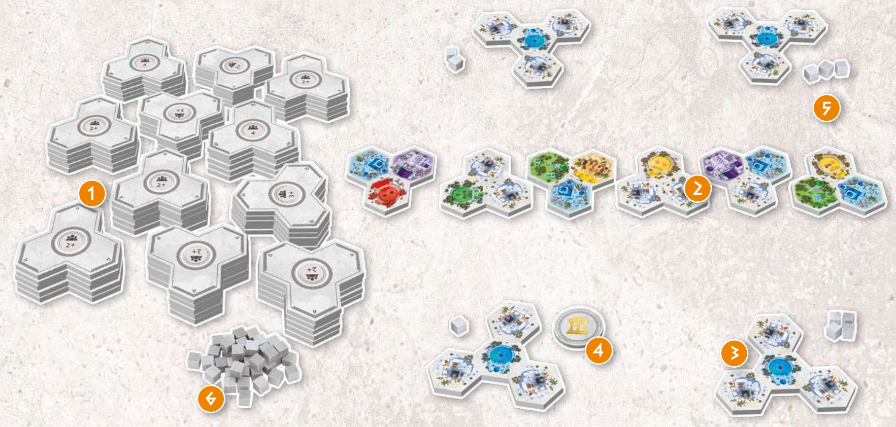
Example of setup for 4 players.

◆ The remaining Stones are placed nearby ♦