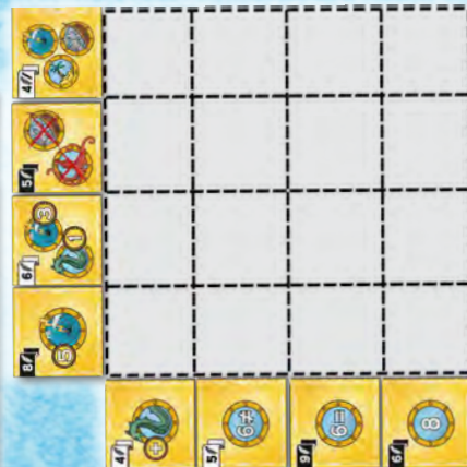
Example of 3 player setup.